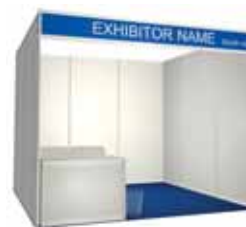
EXHIBIT STAND SCHEMES